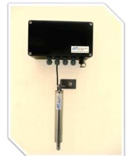
Tilt meter installed with datalogger

Collapse of a building or bridge is often preceded by change in tilt of affected areas. The above instrumentation is a standardized low cost system effectively used to online monitor different type of structures to give timely warning on impending danger. The purpose is to assist and inform owner/designer/contractor/architect about continued performance of structures under gradual or sudden changes to their state. The main factors affecting the performance is degradation of structure with age, undue settlement/tilt due to soil conditions or nearby construction activity, vibrations due to traffic, ground water level, atmospheric conditions and movement of slopes in hilly areas etc. This may be reflected in abnormal changes in tilt and settlement values.