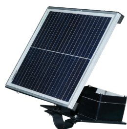
ESP-12V1A Solar power supply, 12 VDC, 1 A