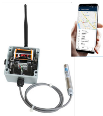
Vibrating wire piezometer connected to node

The application provides step-by-step instructions and displays whether the radio signals or battery strength is good enough.