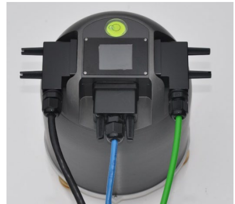
Figure 1 Strong motion Accelerometer

After installation the sensor output offsets are nulled with motorized zeroing mechanism.