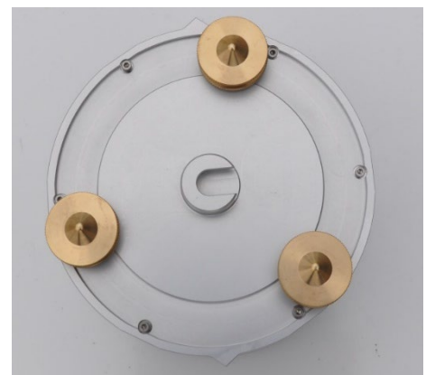
Figure 2 Accelerometer base with fixing point and Orientation indicators machined to the base of the sensor

Acceleration Ground referenced Power Spectral noise estimate in 1 Hz bandwidth in units of (m^2/s^4)/Hz