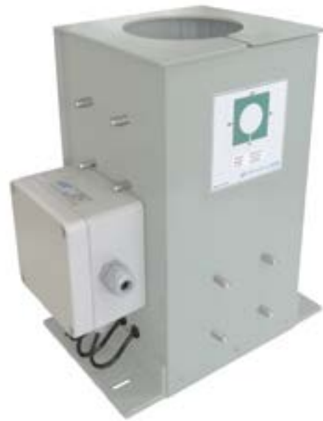
Model EPR-01S automatic readout unit

The device is constructed from stainless steel and is maintenance free, designed to work in hostile environment. Installation is simple and quick.