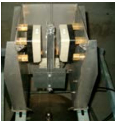
Inside view of model EPR-01S automatic readout unit with targets and transducers