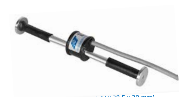
EDS-20V-E (Overall size 170 x 28.5 x 30 mm)