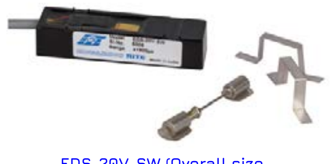
EDS-20V-SW (Overall size 87 x 22 x 18 mm)

The sensor assembly is encapsulated in a moulded protective cover. It is provided with a single part sensor coil rectangular housing suitable for mounting directly over the strain gage and completely enclosing it forming a watertight enclosure. Pair of clamps positioned between a pair of embossed locating points over the sensor coil housing is spot welded to secure the housing to the substrate.