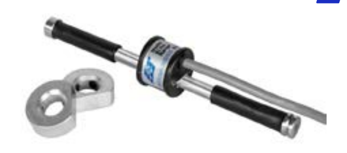
EDS-20V-AW (Overall size 180

Groutable reinforced bar annular mounting blocks are available for surface mounting the strain gage to a concrete structure.