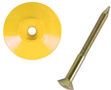
pavement settlement point details