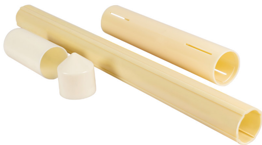
Inclinometer access casing with couplings and end caps

ABS access tubes have longitudinal keyways, specially produced to close tolerances. Wheels of tilt sensing probe can run smoothly inside these keyways. Access tubes are 3 m (~9.85 ft) in length. Different kinds of couplings are available to rapidly join access tubes. Telescopic couplings are available in case settlement is expected to take place. Design of these couplings ensure that correct alignment of keyways is maintained throughout depth of gage well.