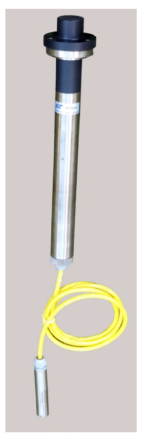
Figure 1 A typical water level sensor (bottom) connected with signal cable to the datalogger with cellular phone telemetry module (top) for installation inside boreholes.

For pressure sensors with a measuring range of over 50 mwc the effect of change in atmospheric pressure is much less than the accuracy rating of the pressure sensor so generally gauge pressure sensors are not used for measurement ranges over 50 mwc.