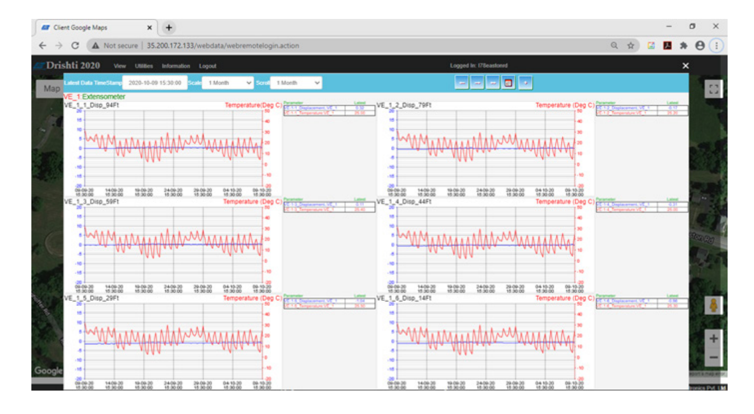
Multipoint Borehole Extensometer data